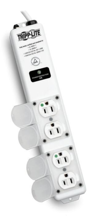
SPS415HGULTRA and SPS406HGULTRA UL 60601-1 Surge Protectors with Fault Protection