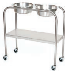
Double with Shelf