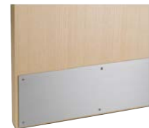
Mop & Kick Plates