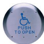
Activation Switch with ADA Logo