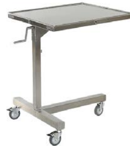
Extra Large Tray