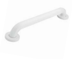
White Powder Coated