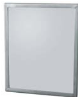
Seamless Mirror Concealed Mount