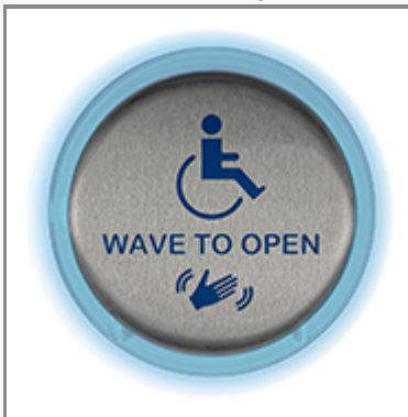
Touchless Door Solutions