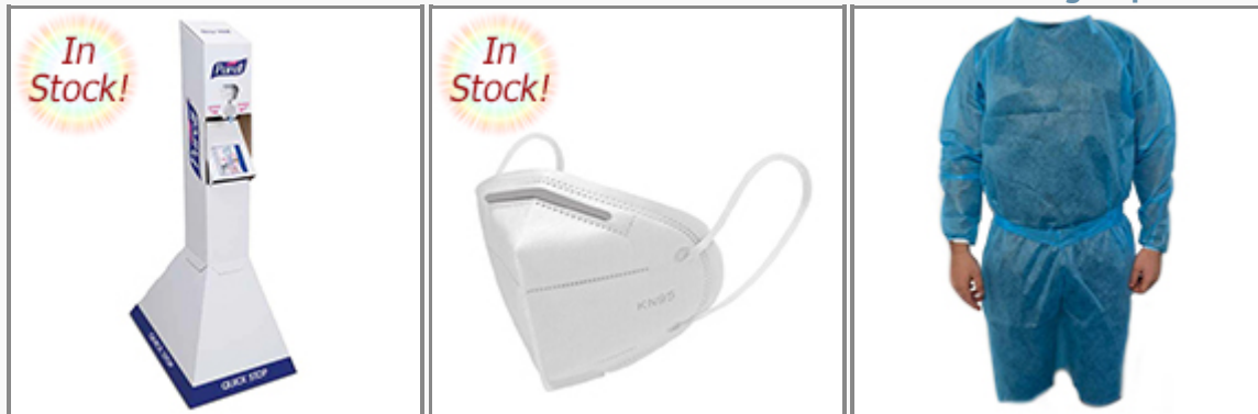
Hand Sanitizer Stations