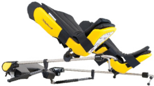
Refurbished Yellofin® Lift-Assist Stirrups