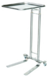
OR & ER Equipment