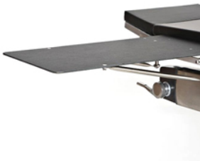
Surgical Table Accessories