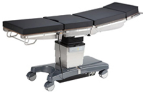
Surgical Table Pads