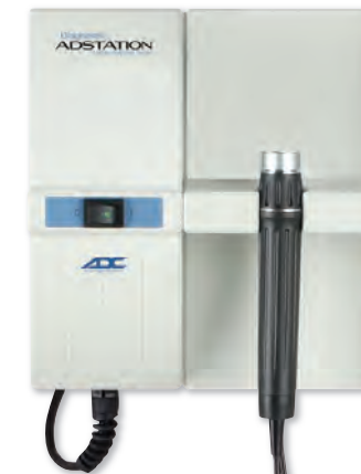
Diagnostix™ Adstation™ Wall Transformer