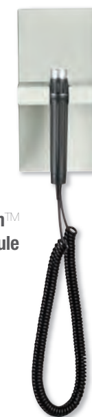
Diagnostix™ Adstation™ Wall Extension Module

A complete diagnostic solution that puts a full assortment of core diagnostic tools within easy reach. Modular system allows practitioner to start with a single EENT instrument, then add up to three additional EENT instruments, a clock aneroid sphygmomanometer or the revolutionary Advview™ modular diagnostic station.