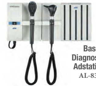
Basic Diagnostix Adstation™ AL-83815