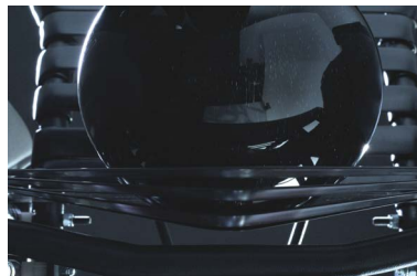
CTS Strapping flexes for individualized fit & superior comfort.