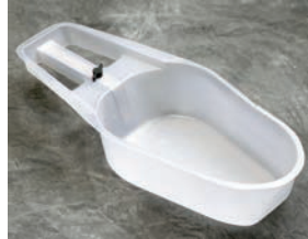
Commode pan with basket (included)