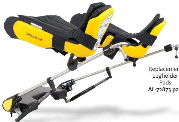
Replacement Legholder Pads AL-72873 pair