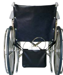
URINARY DRAINAGE BAGS