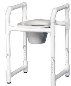
Specialty Commode Frame