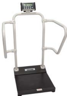
UP TO 1,000 LBS. CAPACITY