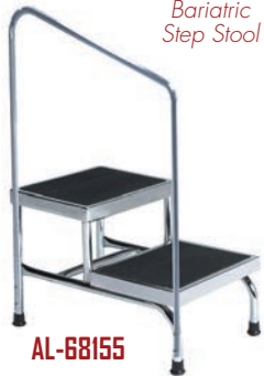
Bariatric Step Stool