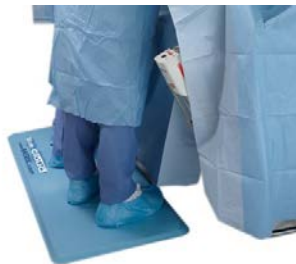
Gel Anti-Fatigue Mat