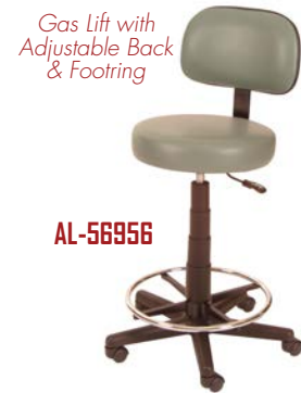
Gas Lift with Adjustable Back & Footring