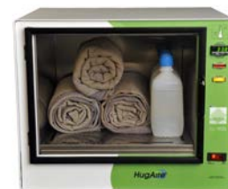
Mini Table-Top Warming Cabinet AL-85926