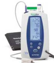
Spot Vital Signs Monitor