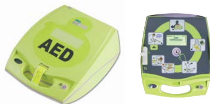
Real CPR Help Technology