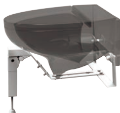
Fits Virtually Any Toilet In Use Today!