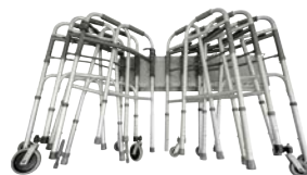
Folding Walker Wall Storage