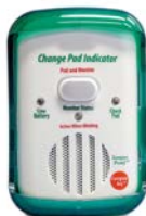
Fall Monitor with Change Pad Indicator