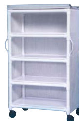
Deluxe Linen Cart