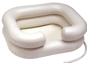
Easy Shampoo Basin