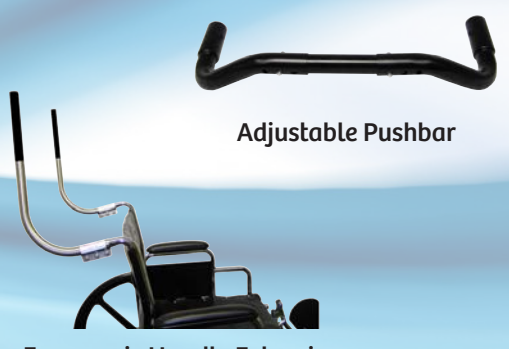
Ergonomic Handle Extensions