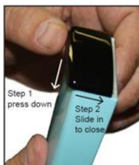
Photo C Close with keypad facing away from you

Optional screw for the battery compartment is in bag with remote