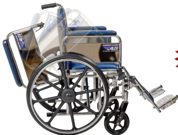
Comfort Classic™ Flip Back Folding Solid Seat