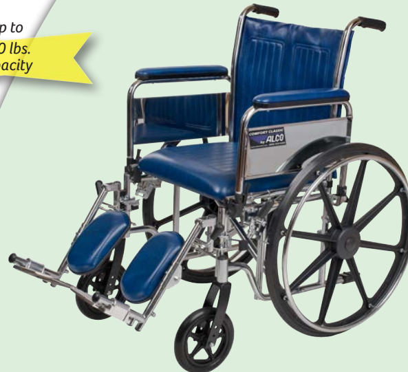
Comfort Classic™ Folding Solid Seat