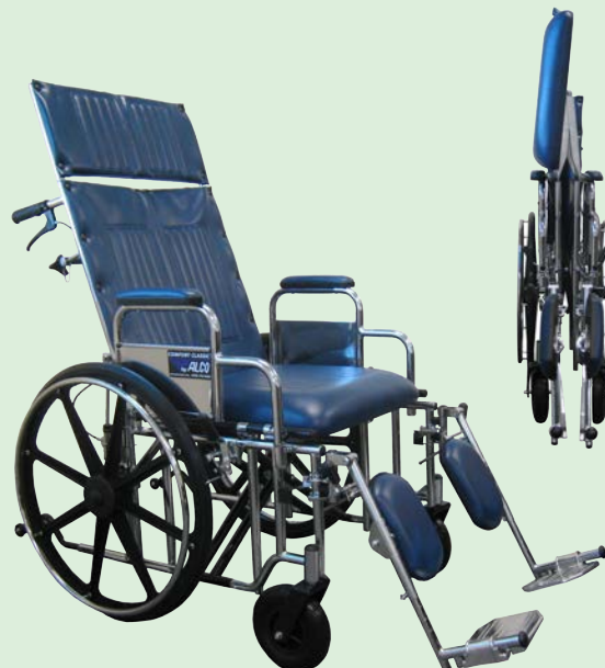
Comfort Classic™ Full Reclining Folding Solid Seat

SAFETY FIRST Removable & locking full arms for patient safety & easy transfer