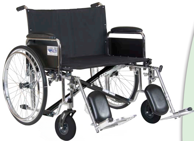
Classic™ 700 Wheelchair