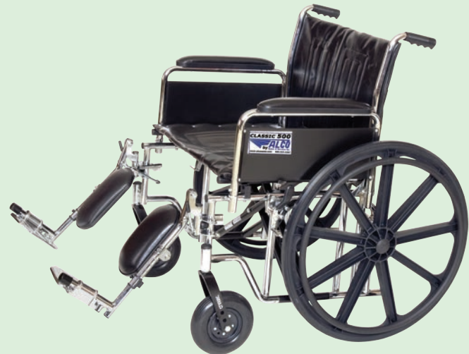
Classic™ 500 Wheelchair