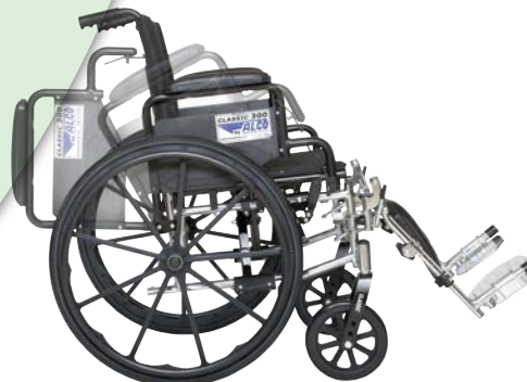
Classic™ 300 Transport