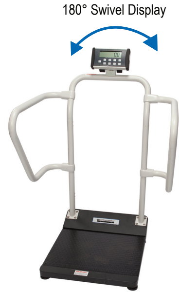
180° Swivel Display