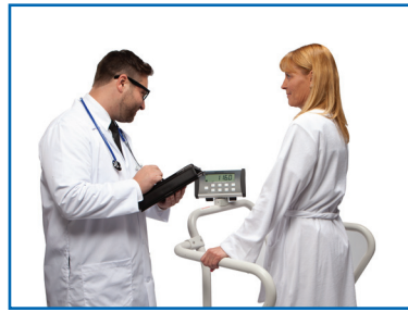
“LIVE” Handrails for patient stability