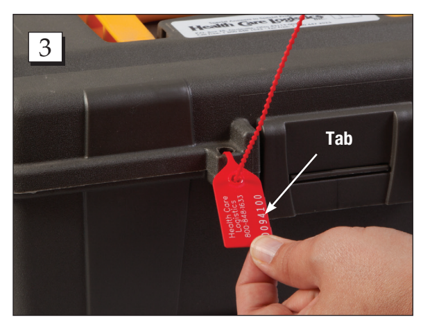
Step 3. Utilize the "TUG" test by grasping the tab of the seal, gently tug on it to determine closure. If you are able to loosen the seal, IT IS NOT FULLY LOCKED. Remove the seal and replace with a new one.