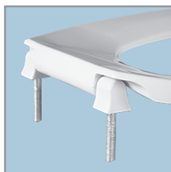
PLASTIC HINGES WITH STAINLESS STEEL POSTS AND PINTLES

Non-Corrosive 300 Series Stainless Steel Posts, Pintles and Nuts