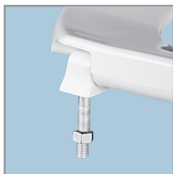
NON-CORROSIVE STAINLESS STEEL NUTS