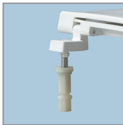
STA-TITE ® COMMERCIAL FASTENING SYSTEM ™