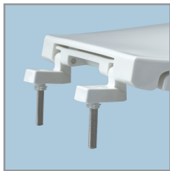
PLASTIC HINGES WITH STAINLESS STEEL POSTS AND PINTLES